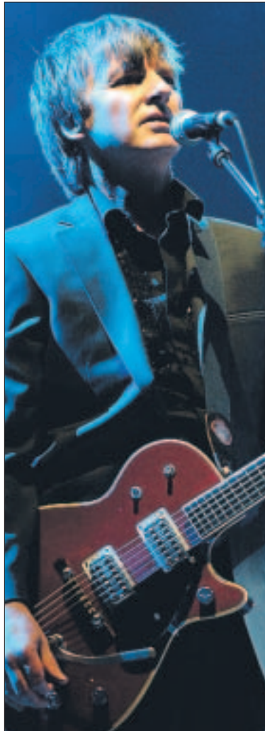
Neil Finn performs at Coachella music festival in 2007 in Indio

In my private rock 'n' roll heaven, a sartorially splendid Leonard Cohen would take off his fedora to greet me as I waltz through the gates, while tattooed angels raise their beatific voices with his to the chorus of Hallelujah .