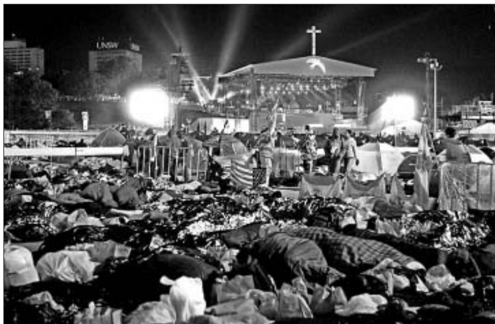
Holy night: Randwick racecourse became tent city.