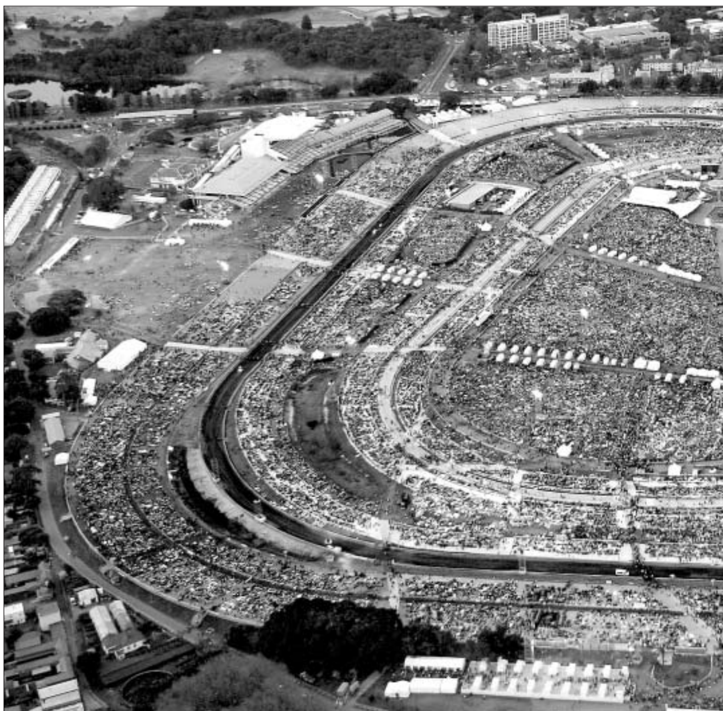
Masses of humanity: an aerial shot of Randwick racecourse shows a sea of pilgrims