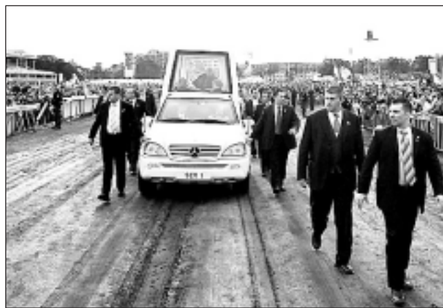
Secure: the popemobile is guarded.