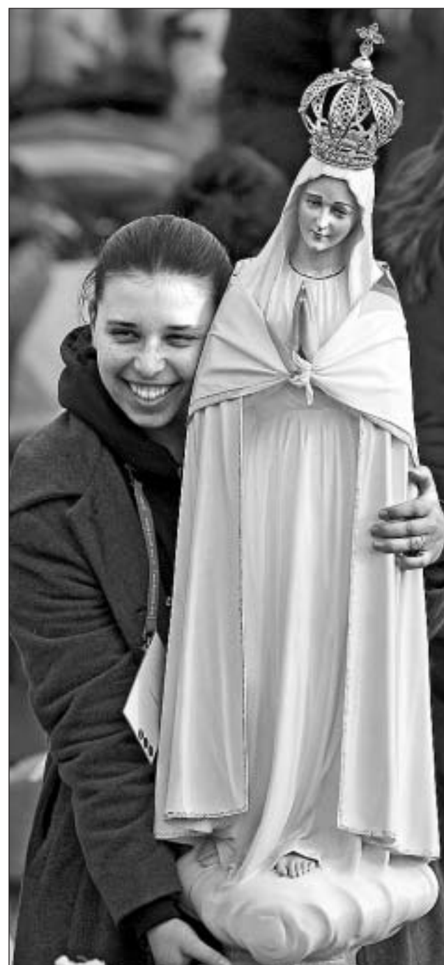
Personal devotion: a pilgrim embraces a statue of the Virgin Mary as she awaits the pontiff.