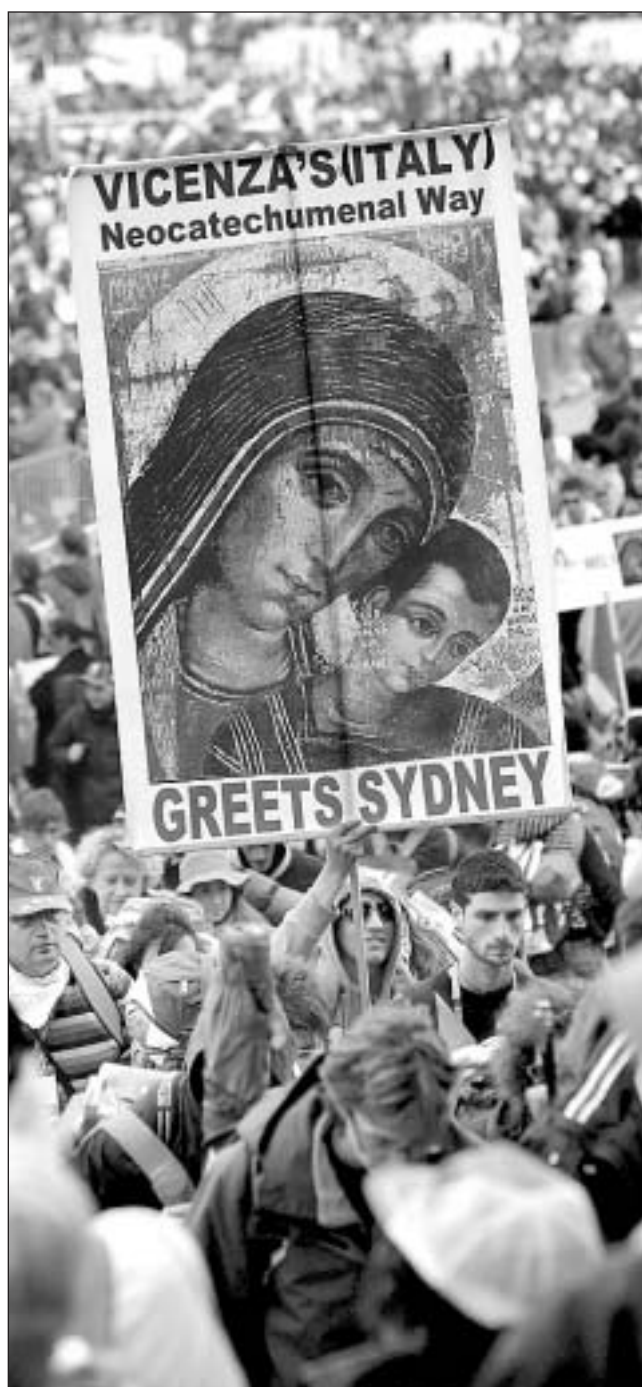
Faces in the crowd: a young pilgrim from Italy spreads the message.