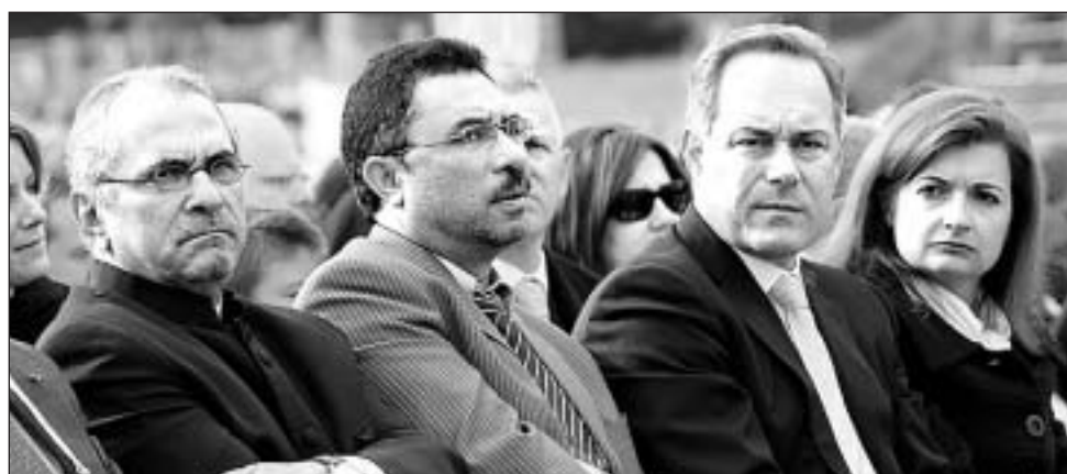
VIPs: East Timor's Jose Ramos Horta (left) and NSW Premier Morris Iemma (second from right).

The ambulance service reported hundreds of flu cases since WYD events began — but for all those pilgrims seeking medical help, hundreds more were coughing and wheezing, but refusing to leave the racecourse.